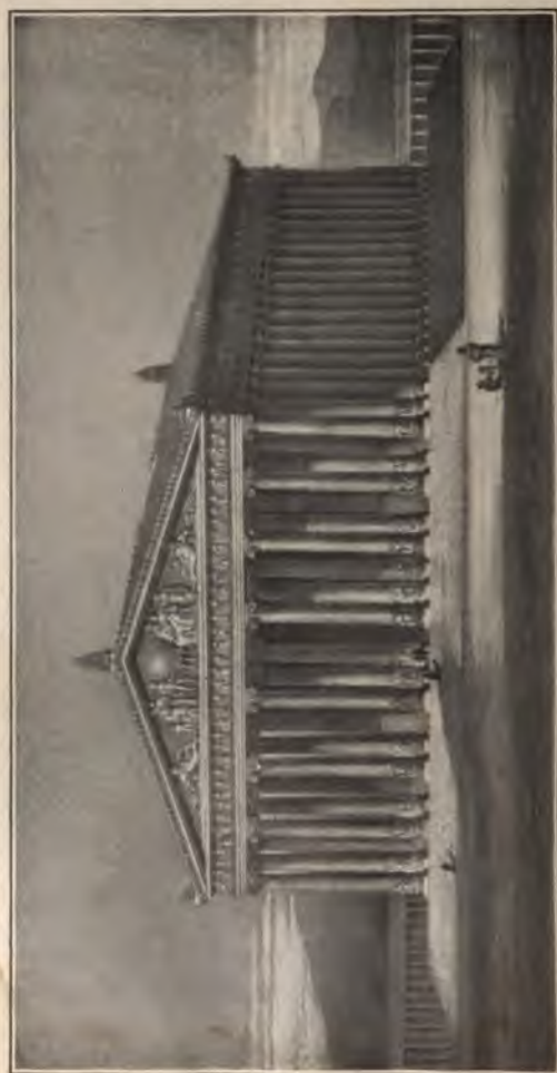
TEMPLE OF DIANA